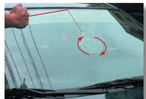
Wire Follows the Contour of the Glass.

For a technician to remove a windscreen by himself. Wire-Buddy attaches to the inside window and cutting wire is pushed through the urethane and connects to the wire handle. By pulling the wire handle from outside of the vehicle the return spring allows the wire to move back & forth, cutting and separating the glass from the adhesive.