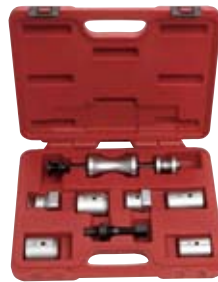
Supplied in Carry Case

A detailed list is supplied with each kit.