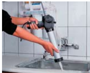
BUILDING INDUSTRY & CONSTRUCTION