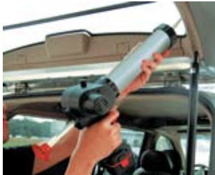
AUTOMOTIVE COMMERCIAL GLASS

Great for avoiding hand, arm & muscular problems associated with manually operated guns & working in colder climates. Essential for the Automotive Glass Replacement, Building & Construction Industries.