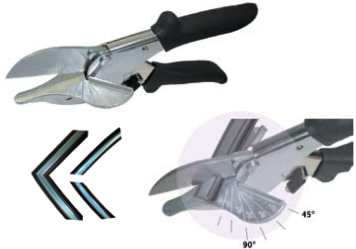
MITRE CUT MOULDINGS FOR PROFESSIONAL MITRE JOIN

Many technicians now use universal glass mouldings on most glass replacements as it has become cheaper than using original mouldings. When the moulding requires an angle cut, these mitre cutters help you achieve an accurate cut for a professional finish. Also ideal for cutting rubber, plastic, bodyside mouldings or wood.